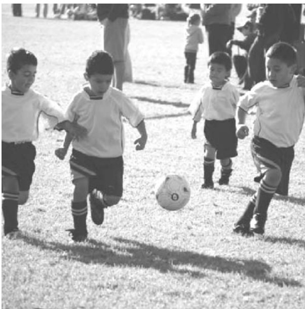
Wenty Waratah Under 6 Stingrays in action on the Gala Day.

On Sunday 25th May 2008, the Roo Ball Gala Day for Under 6, 7 and 8's was held at Ted Burge Sportsground. The rain stayed away and everyone had a great day. The huge smiles on the players faces as they received their medals at the end of the day was great to see. I am sure there were some fantastic team photos taken by parents. To all the volunteers who assisted on the day either in the Canteen, Cooking the BBQ, Ground set up and pack up, refereeing or being Ground Official a BIG THANKYOU , in ensuring we had a successful day. To the Wenty Waratah Committee, well-done in organising a fantastic Gala Day, it was pleasing to here from Coaches, Managers and Spectators from inside and outside the club on how well organised the day had been, and what a great day everyone had.