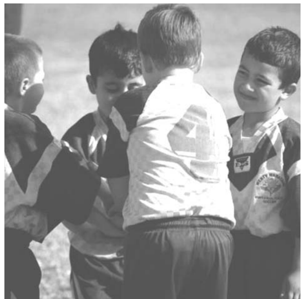
Wenty Waratah Under 6 Goannas talking tactics on the Gala Day.